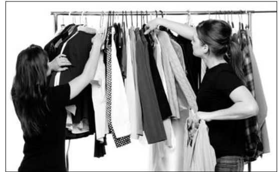
Purge your closets, bedrooms and cabinets with Operation Organization.

LOS ANGELES – Whether you are a stay-at-home mom, business executive or anyone in between, I think you will agree that order and neatness help alleviate stress, and create a more peaceful environment. Clutter and chaos have finally met their match with Operation Organization, Inc. by attacking those chores you are simply too busy to do (or just don't want to do)!