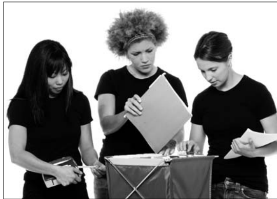
Reorganize everything from your desk, computer hard-drive or your entire workplace.

"Our most popular services are setting up filing systems, orga-